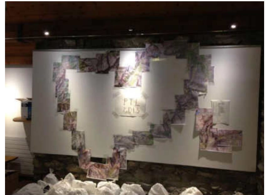
Maps of the PTL route at race control