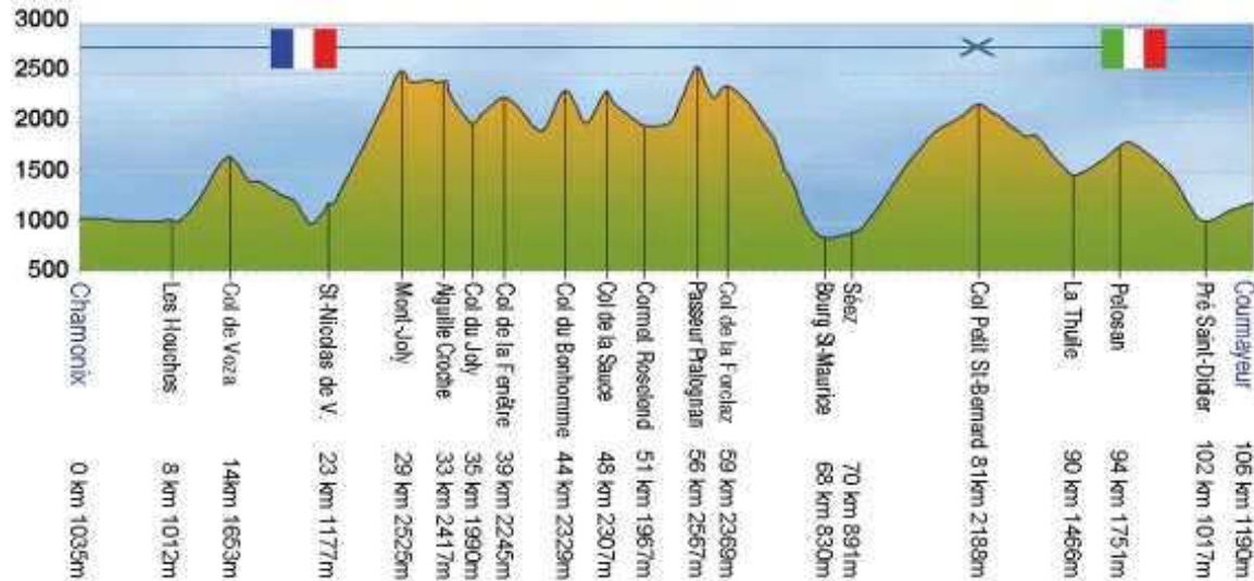
The TDS route, which goes South through Beaufortain area, with more challenging terrain than the UTMB (but not the PTL)

Kirsty Hewitson and Nancy Bunyan finished the CCC.