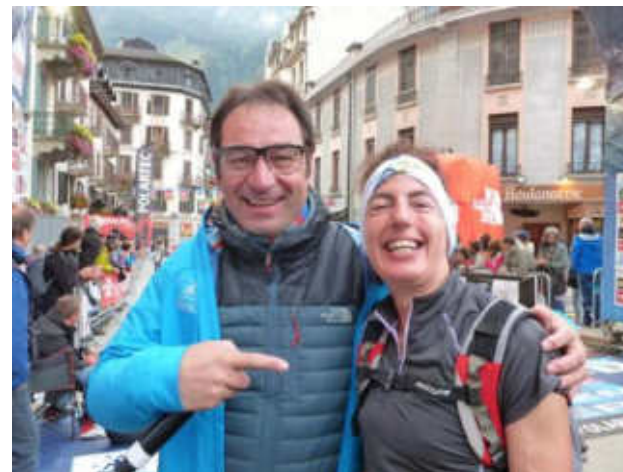
At the finish, with the French commentator