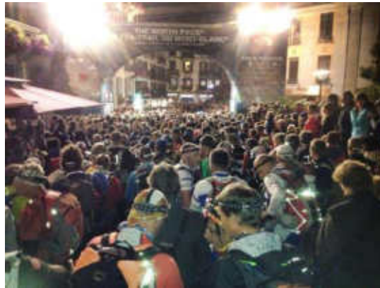
Start of the PTL and the team back at the finish 103 hours later, after 300km and 24,000m of ascent