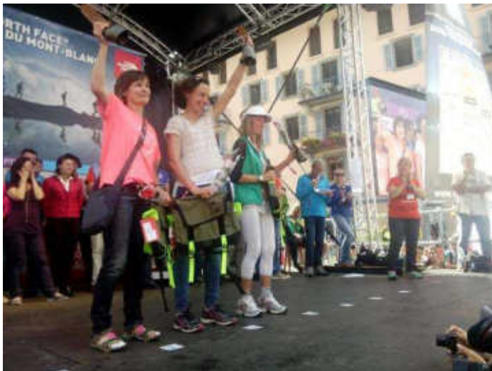
UTMB V2F Podium