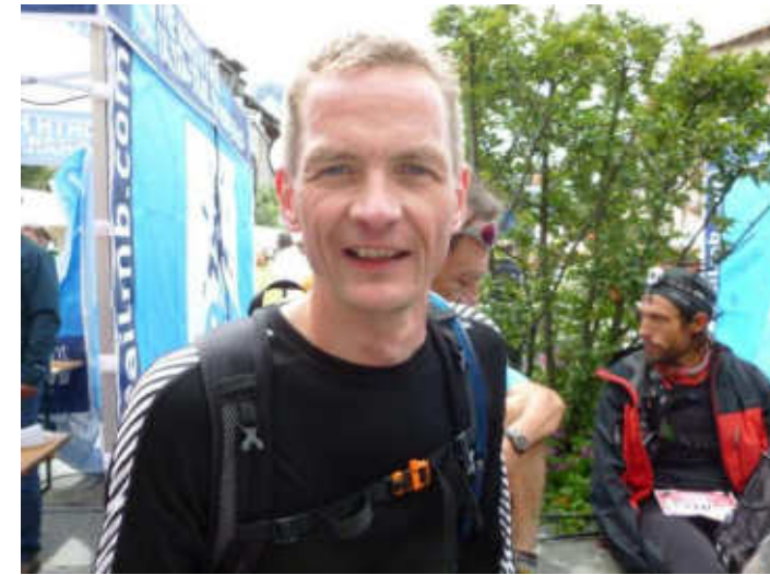
... and at the finish