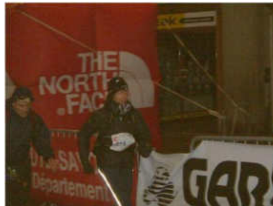
Another wet early morning finish in Chamonix